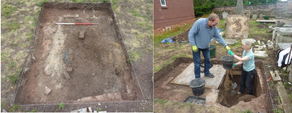
Underground vault to east of Tomb 45 before excavation. Looking east.

Because there is no surviving memorial we do not know who is buried in the vault.