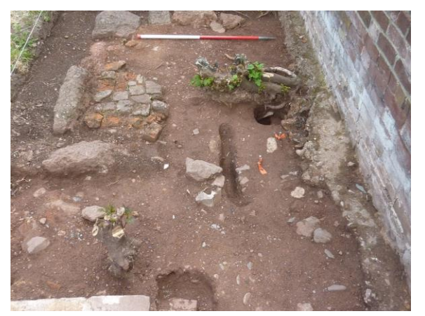
The small building with slot and post-hole at the north end. Looking south.