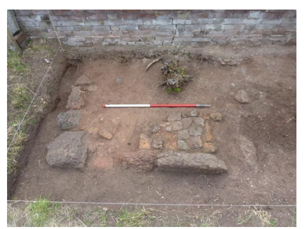
The small building. Looking west.