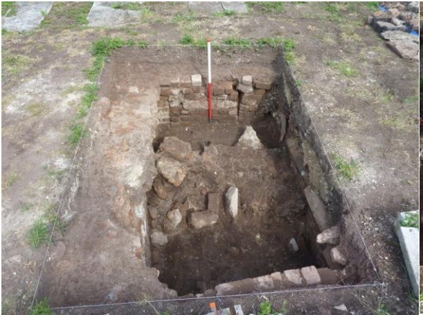
Vault after excavation. Looking east.