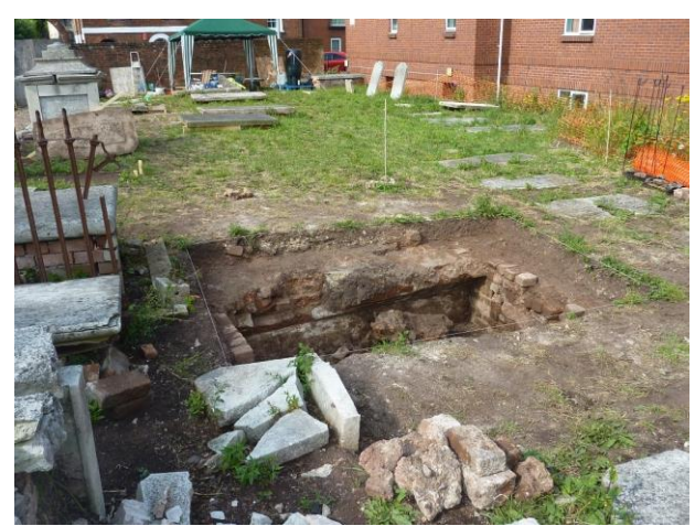
The location of the vault in the graveyard. Looking north.