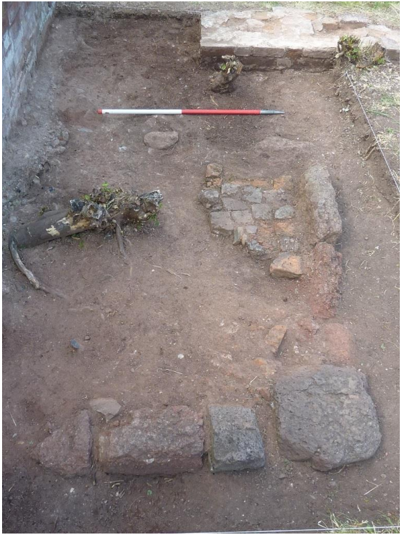
The full outline of the small building revealed by the removal of the fallen slab from Tomb 6. Looking north.

The remains of a small building, located beside the west boundary wall at the north end of the site, were identified and excavated in 2014. At this time, the north end of the building was obscured by the displaced slab from Tomb 6. The removal of the slab by the fire brigade in April this year allowed the reminder of the structure to be investigated. The north-east corner and return of the north wall, consisting of a single block of Heavitree stone, were found, establishing that it was a rectangular structure 2m long north/south and 1.5m long east/west. The break in the north wall footings may have been an entrance. A north/south slot 0.7m long, 0.10m wide and 0.15m deep that extended through the gap in the north wall, and a circular post-hole 0.20m in diameter and 0.30m deep located at the west edge of the building, were also found.