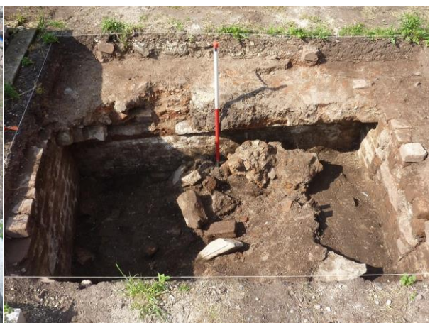
Vault after excavation. Looking north.