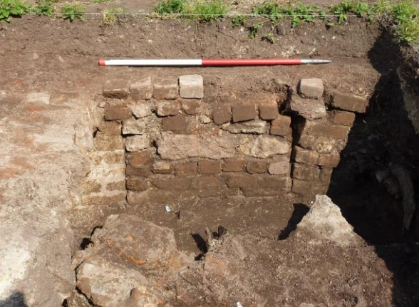
Blocked entrance in east wall of vault.