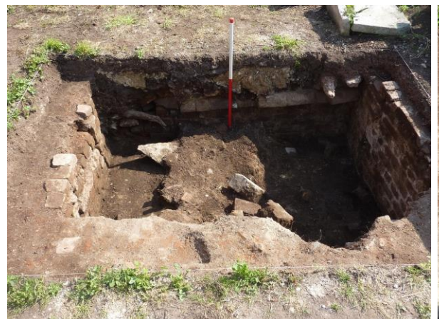
Vault after excavation. Looking south.