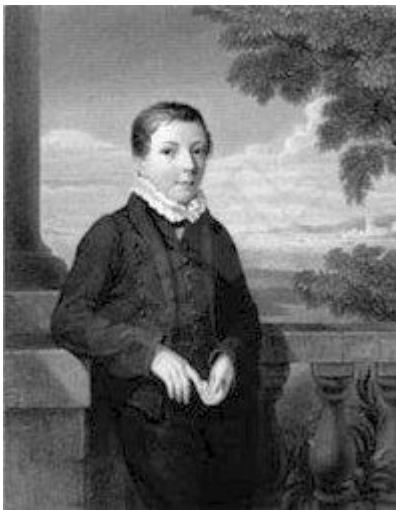
George Parker Bidder 'the calculating boy'.